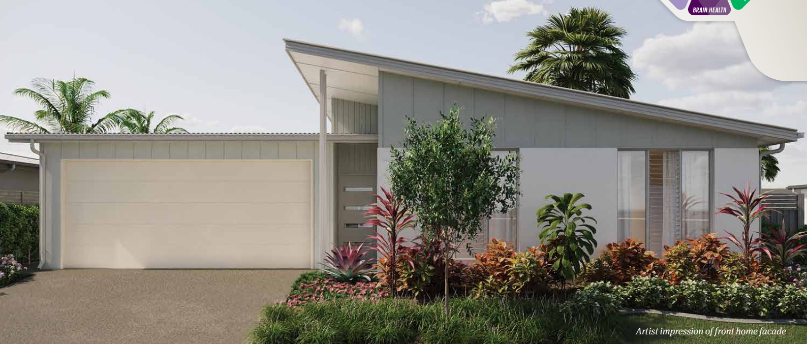
Artist impression of front home facade