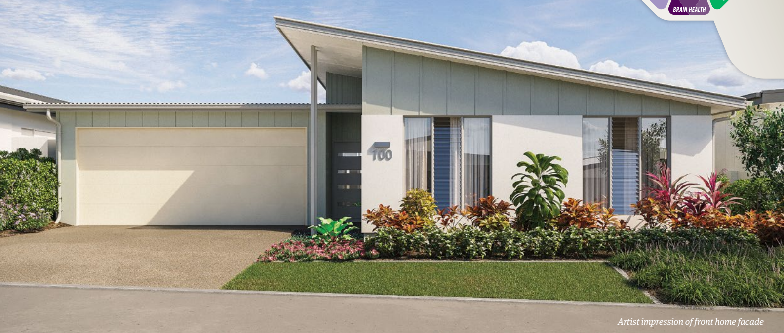
Artist impression of front home facade