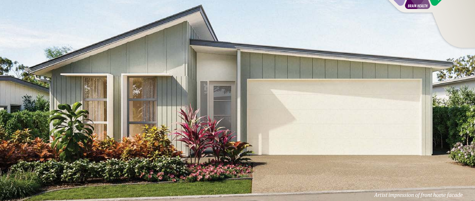
Artist impression of front home facade